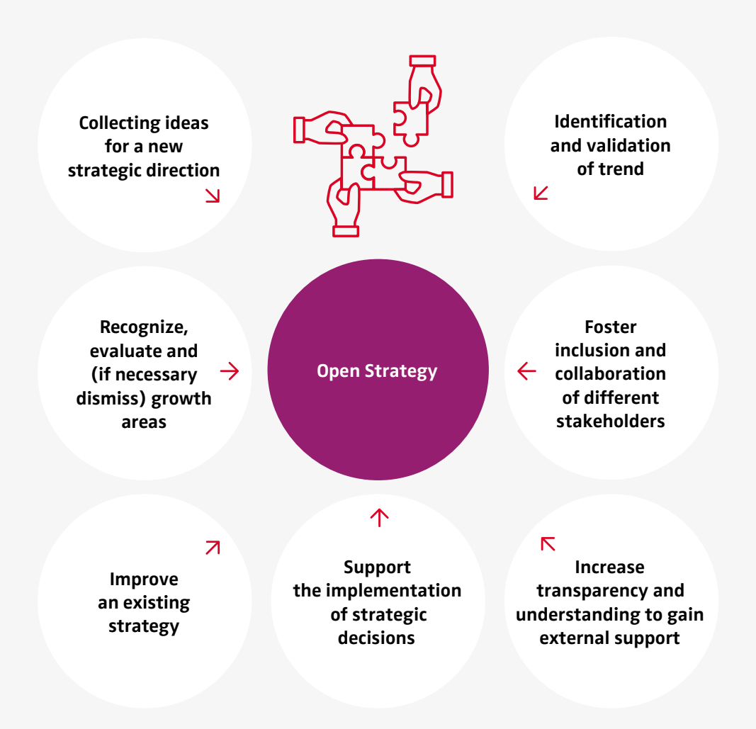
FIGURE 1 > Why companies open their strategy-making

buy-in, shared understanding, stronger commitment, and a more effective implementation can be achieved when those who must implement a strategy are involved in the process of developing it. For these reasons, it has been found effective to include internal implementers in a crowd project. In other cases, organizations claim that including a broader set of stakeholders increases external acceptance because it makes the strategy formation process more transparent and comprehensible to the general public.