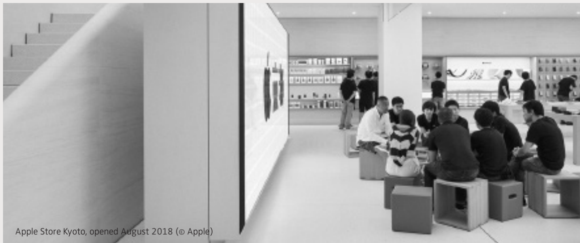
Apple Store Kyoto, opened August 2018

The store as a DIP offering is configured for ordinary people to combat "feature-itis," the common overemphasis by technology companies on the features of products. Instead, Apple is focused on inviting people to play with its products as they would experience them. In the store, employees are equipped, of course, with Apple devices. But more importantly, an internal app allows employees to capture insights from the experience in interactional creation of individuals. This includes employees offering customer support through the Genius Bar after purchase. A digital concierge process, available in both self-service and employee-assisted modes, orients entering customers, directing them to appropriate parts of the store or fixing an appointment at the Genius Bar for walk-ins. With EasyPay as an interface for supporting DIPs, customers can scan the barcodes of accessories in the store, get reviews, ratings and product specs and pay for purchases within the app through Apple Pay in self-checkout fashion.