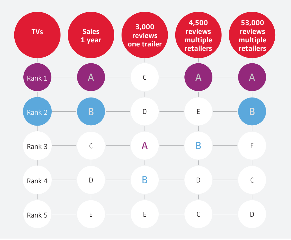
FIGURE 1 > Prediction accuracy of brand preferences in the TV category for different amounts of available data

In the next step, we used the degree of similarity of words to the context to get a rank order of brands and compare this order to actual unit sales rankings of the last 12 months. The point-of-sale data came from our GfK retail panels, which consists of multiple retailers' data aggregated to a total category picture by brand. All data reviews and point-of-sale data were from the U.K. market.