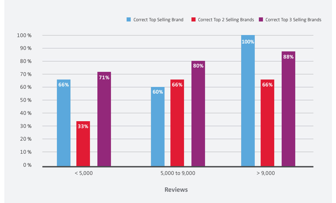
FIGURE 2 > Ability to correctly identify top-selling brands from 10 different categories for different sample sizes

Our sample consisted of data from 36,000 reviews of TV sets. Picture quality emerged as the number one feature and sound quality came second. Sound quality's being so high up should not be surprising since the TV experience actually combines vision and sound, despite its categorization as a